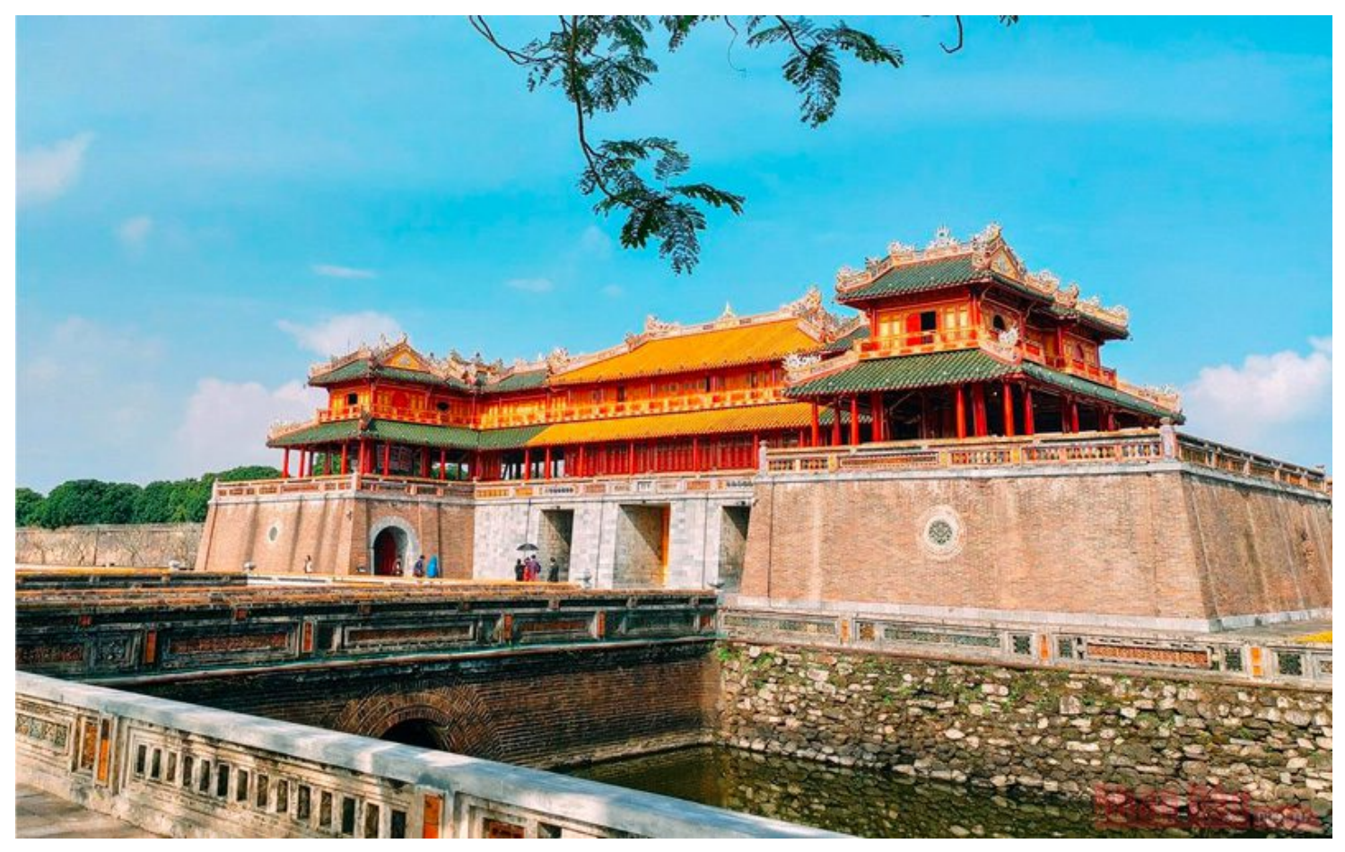
Imperial City of Hue