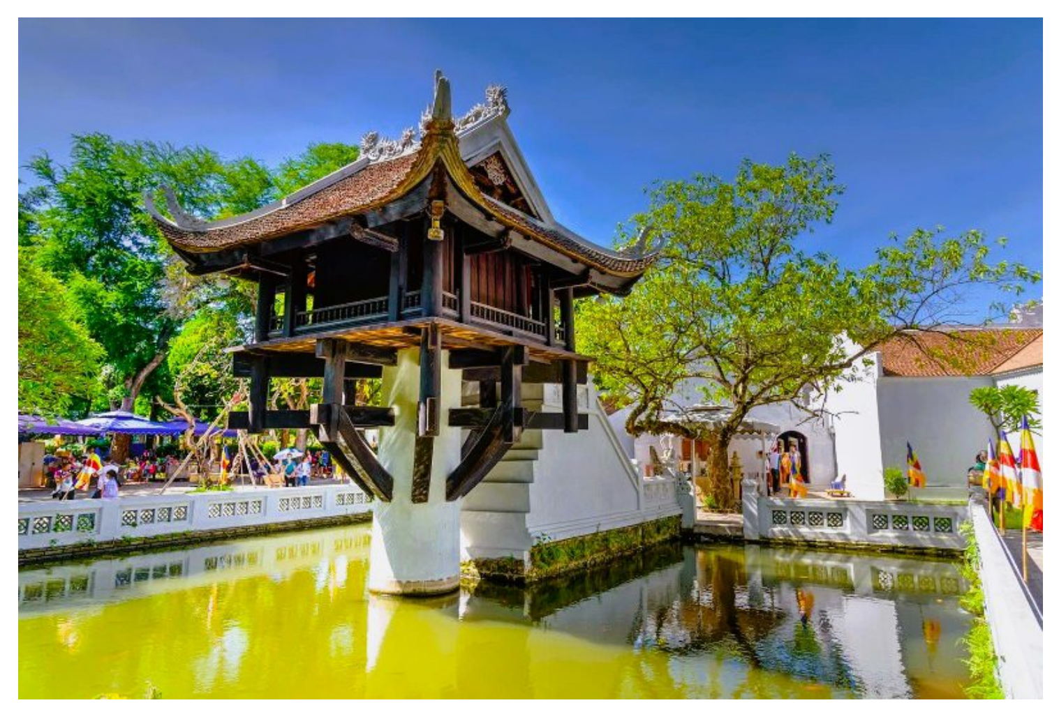
One Pillar Pagoda

- Go on a nighttime motorcycle/scooter/walking tour.